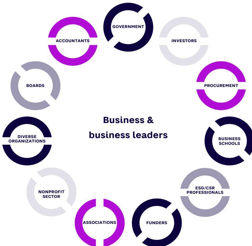
Figure 1. 10 purpose economy levers of change (source: CPEP)